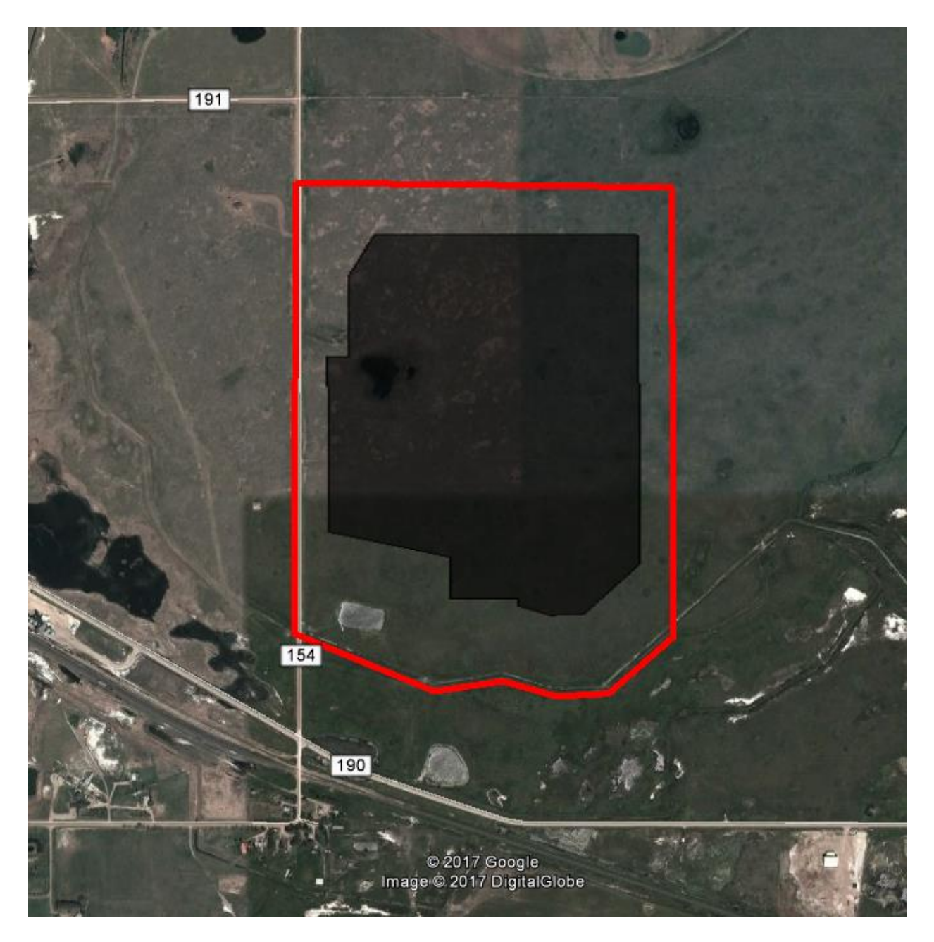
Figure 2: Project Boundary and Proposed Cassils Solar Panel Array