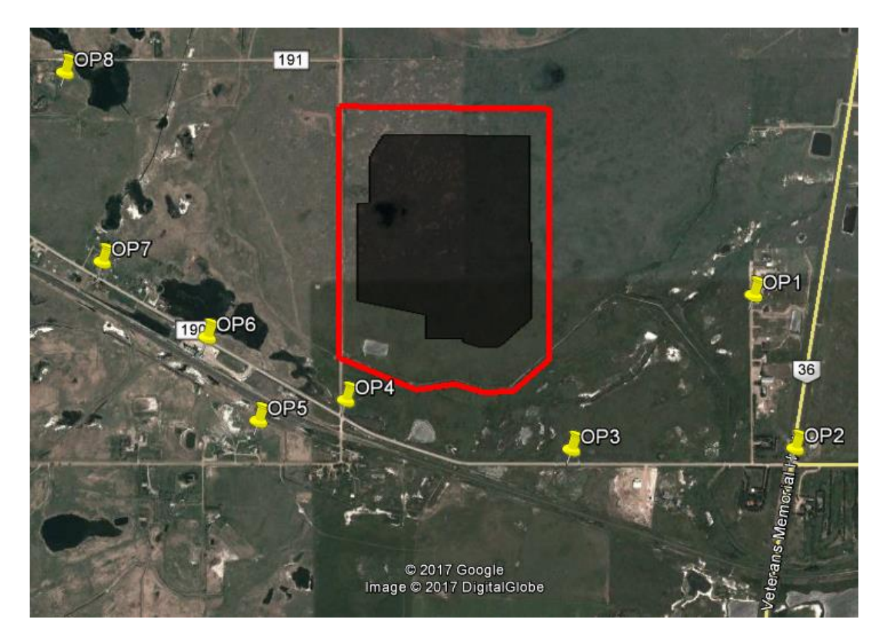
Figure 3: Cassils Solar Array with Observation Points 1 to 8

Table 1 lists the observation points used in the analysis and describes the number of vehicles travelling at the intersection between Veterans Memorial Highway, Highway 542, and Township Road 190, as identified by Alberta Transportation.<sup>5</sup>